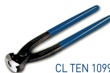
CL TEN 1099