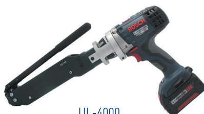
UL-4000 Battery tool