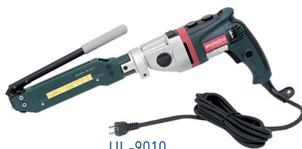
UL-9010 Electric tool