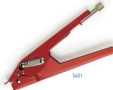
for all band widths