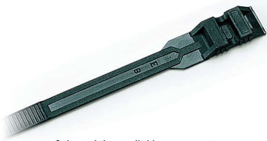
Coloured ties available on request

Nylon ties with flat head. For applications where high resistance is required. The flat head and wide contact surface, together with the external rack closing system, is indicated for hanging lines since avoids damages to isolated cables.