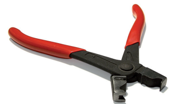
Assembly and disassembly manual pliers